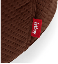
Easy to clean