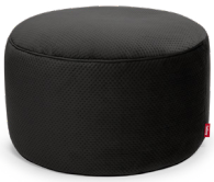
Made from recycled materials